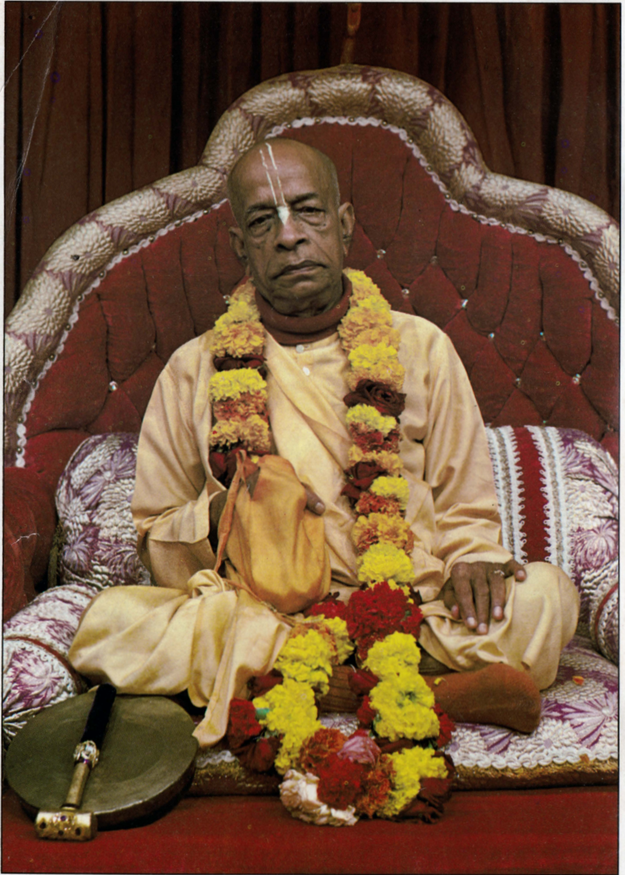
His Divine Grace A.C. Bhaktivedanta Swami Prabhupāda Founder-Ācārya of the International Society for Krishna Consciousness