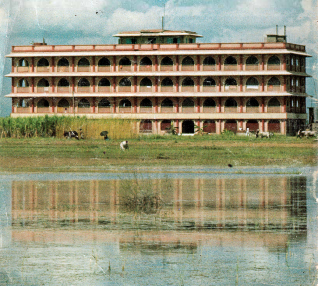
International Guest House at ISKCON's World Headquarters in Śrīdhāma Māyāpur, West Bengal, India.

Śrī Lal Bahadur Shastri Former Prime Minister of India